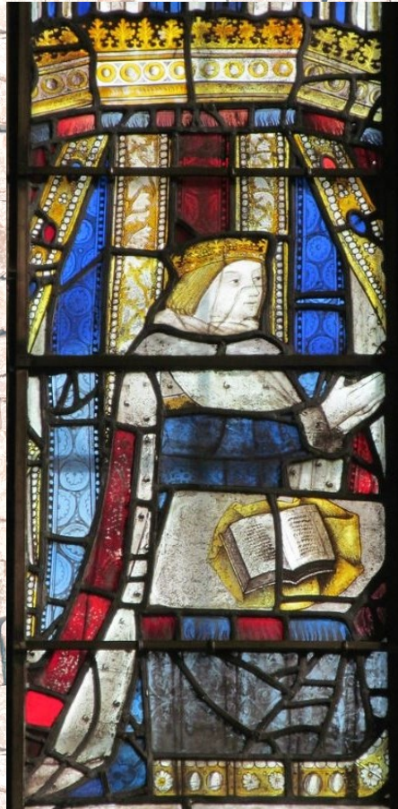
Edward V, in a detail from the east window